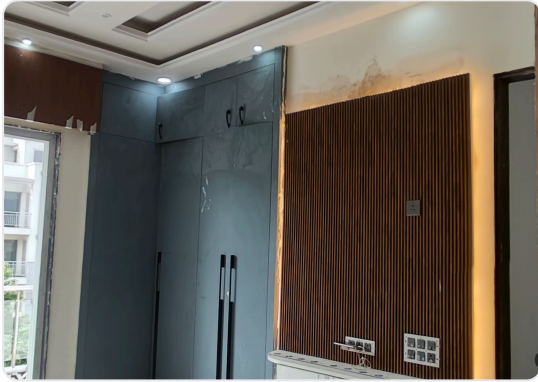
Sector 36 block c house no 93 grater noida