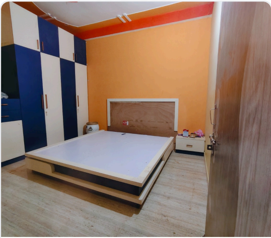
vo V60 | ZEISS 16mm f/2.2 1/33s ISO 12/19/2025