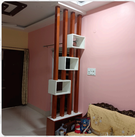
Nenal das, Guwahati